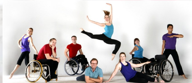
Full Radius Dance